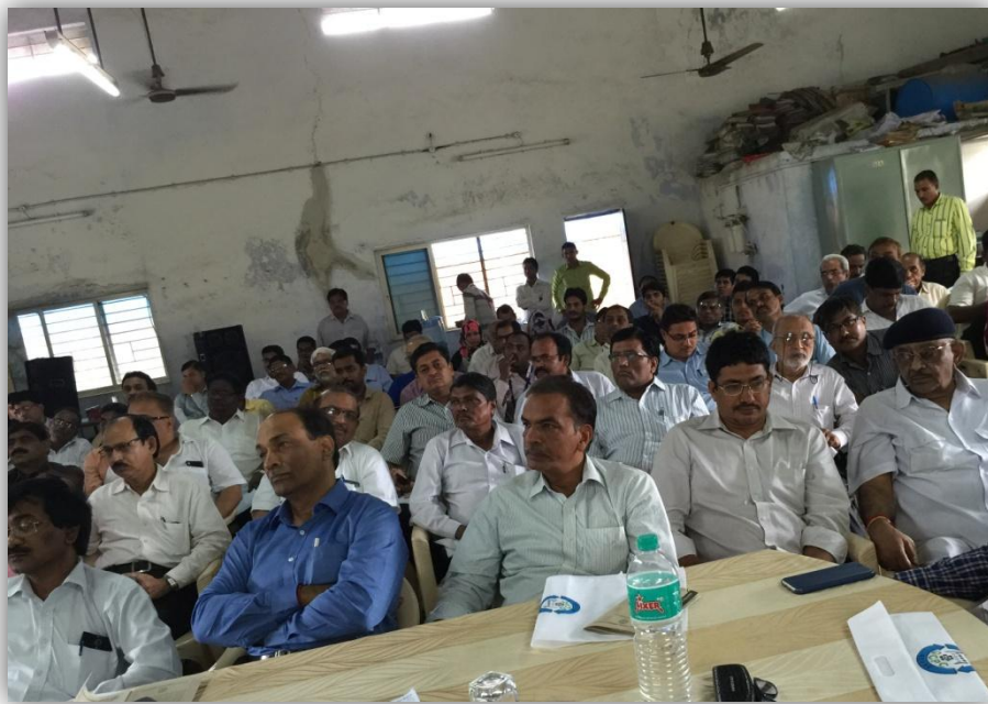
Views of participants at the programme