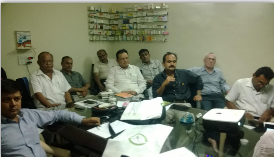
A View of Participants at the programme