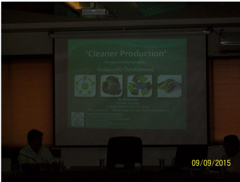
A view of the presentation made at the programme