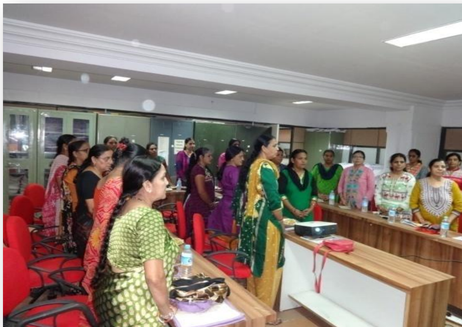
Participants singing Saraswati Vandana followed by Vandemataram