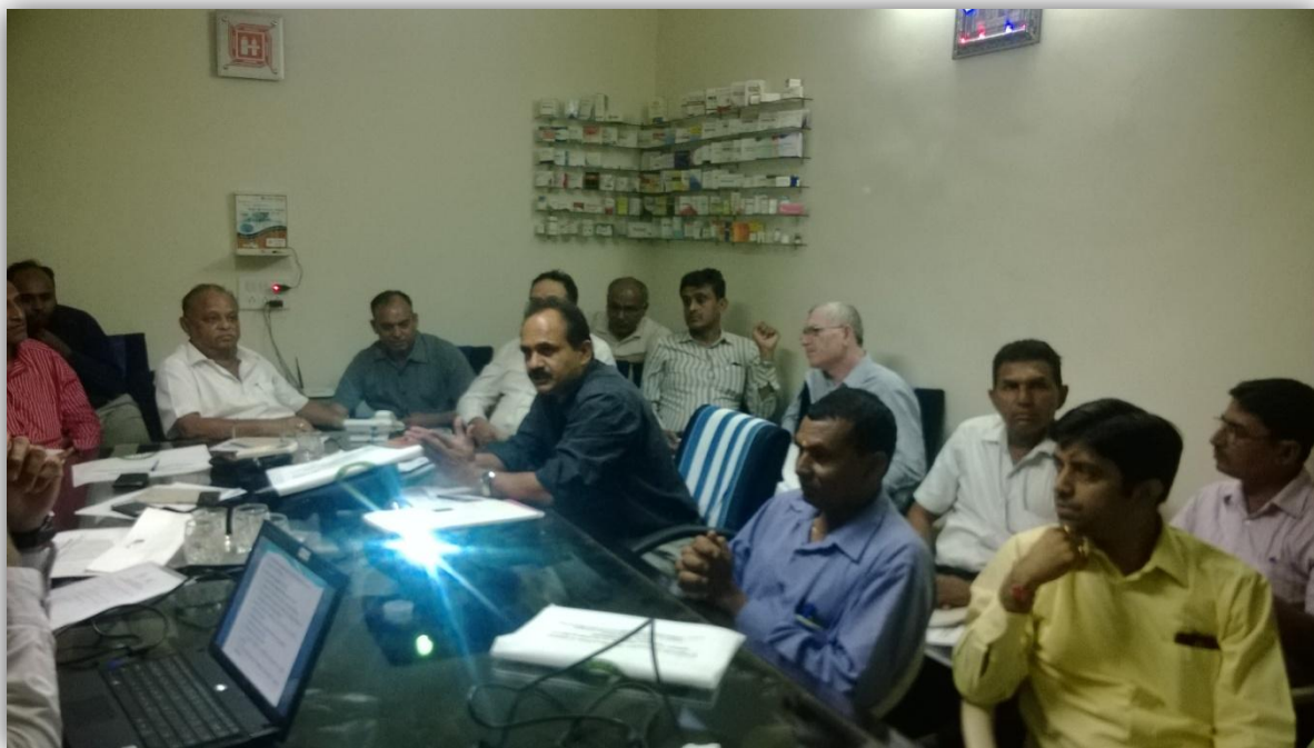
Participants asking their queries to GCPC Team