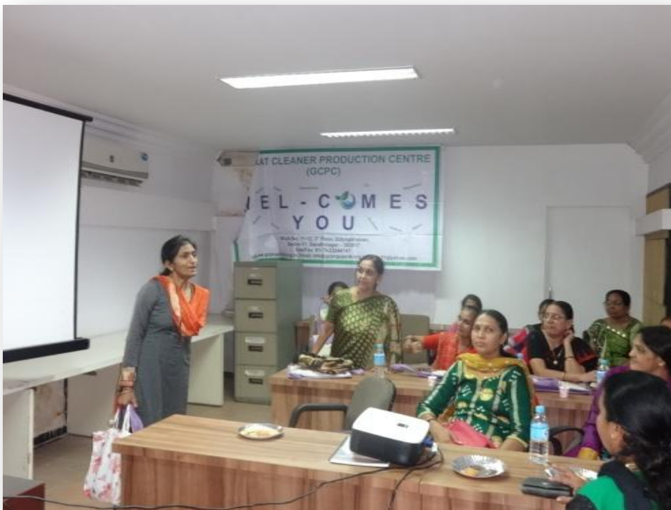
Participants giving suggestions on plastic waste management