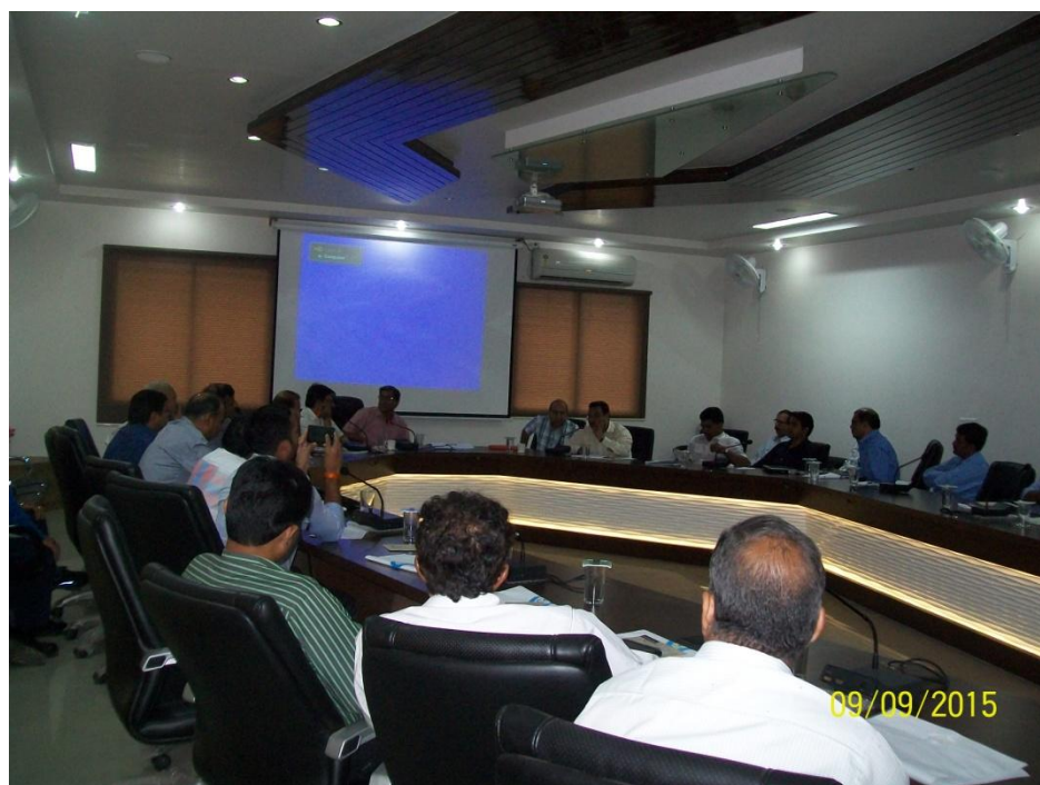
A view of the presentation made at the programme