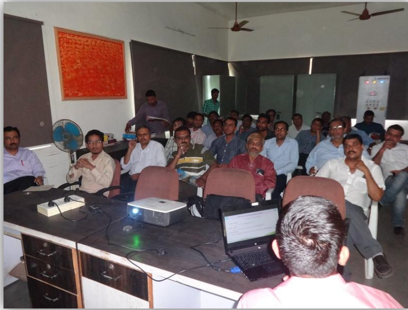
A view of the participants at the programme